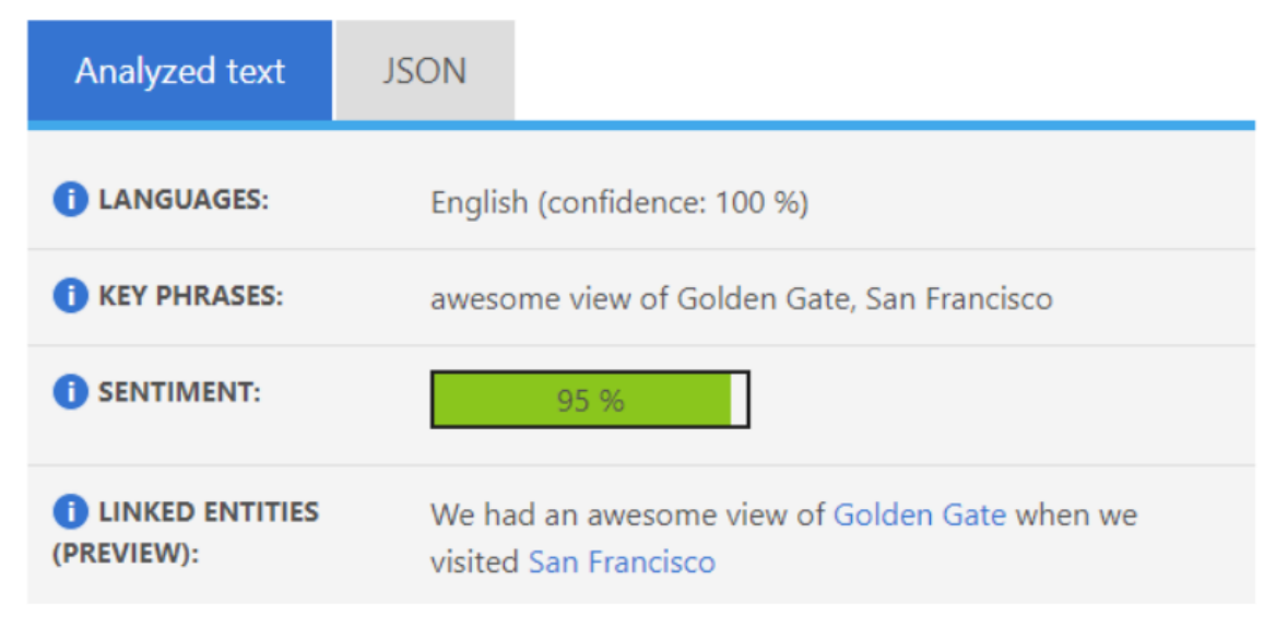
Figure 3: The output from Azure Cognitive Service after processing the results through Text Analytics

In the above example the Azure Text Analytics API produced the results with 95% accuracy for the sentiments. The 95% (0.95) sentment results shows that the opinion/connotation is positive as it is much closer to 1.